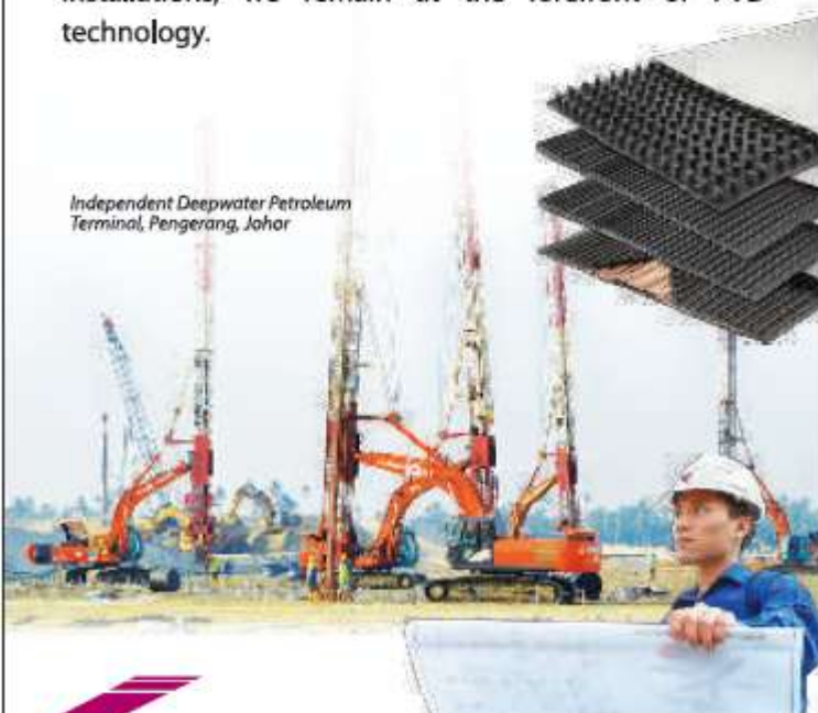
Independent Deepwater Petroleum Terminal, Pengerang, Johor

Coupled with state of the art data loggers, capable of providing real-time data for recording and monitoring installations, we remain at the forefront of PVD technology.