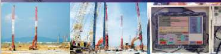
New Low Cost Carrier Terminal (LCCT), Sepang, Selangor.

The Preferred Integrated Geotechnical Engineering Solutions Partner